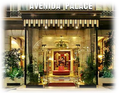
Sunday, March 19 Salema – Faro -- Lisbon

Bid adeus to Salema and the spectacular Algarve. This morning, drive to the Faro airport, turn in the rental car, and take the short flight back to Lisbon and the Hotel Avenida Palace. Enjoy the evening at your leisure. Hotel Avenida Palace (2 nights) <a href="https://www.hotelavenidapalace.pt">www.hotelavenidapalace.pt</a>