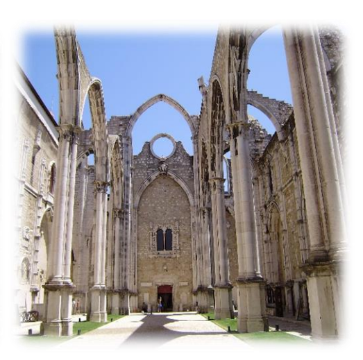
Friday, March 10 Lisbon

Today, experience more of the city's cultural highlights, with a focus on shopping. Ride the iron Elevador de Santa Justa up the hill to the Chiado neighborhood, known for its sophisticated shops and cafés. At the top, enter the Convento do Carmo, a convent destroyed in the 1755 earthquake with its remains left standing as a permanent reminder of that disastrous event. Stop for a coffee break at Café A Brasileira, a 100-year-old Lisbon institution frequented over the years by the city's poets, writers, and philosophers. Order a bica (espresso) and a pastel de nata and discuss your philosophy of life. After experiencing this local tradition, wander down Rua Garrett, a lovely shopping street with mosaic sidewalks, ironwork balconies, and fine shops including the old Bertrand Bookstore and the A Vida Portuguesa gift shop. Continue down the hill to The Ceramic Heart, one of Lisbon's finest ceramics shops. Many ceramic shops sell quality replicas of Lisbon's iconic colored tiles (azulejos) for souvenirs and gifts. Portugal is also famous for its variety of products made of cork, from handbags to umbrellas, sold in shops throughout the city.